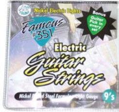
FAMOUS #351 ELECTRIC