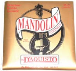
D'AQUISTO M - 21