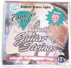
FAMOUS #351 ACOUSTIC