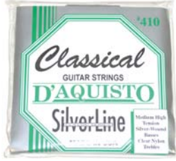
D'AQUISTO #410 CLASSIC