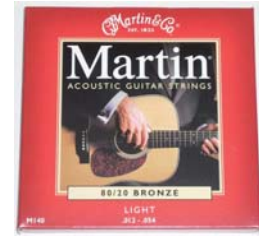
MARTIN ACOUSTIC LIGHT AVAILABLE IN LIGHT MEDIUM AND EXTRALIGHT GAUGES